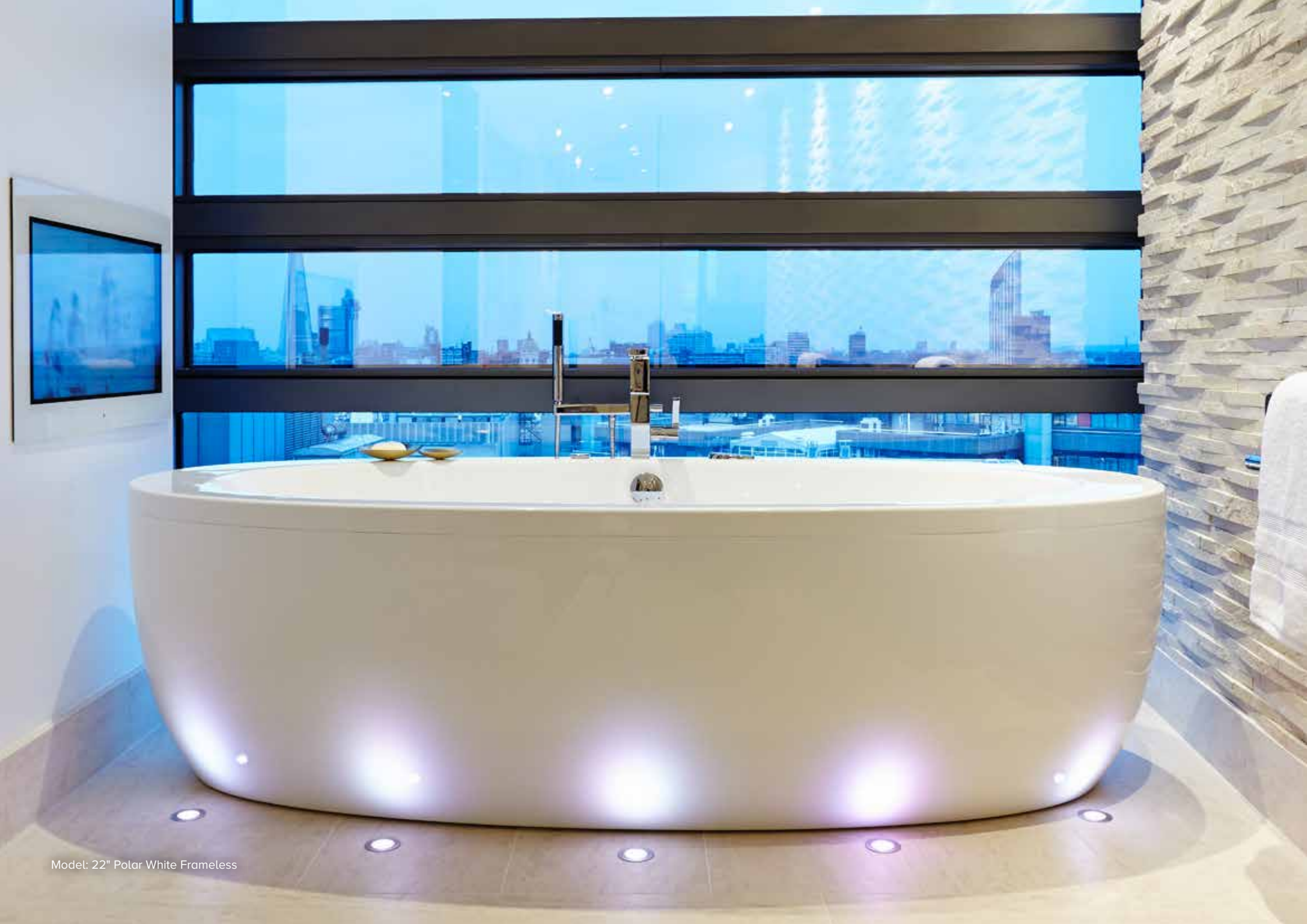
Model: 22" Polar White Frameless