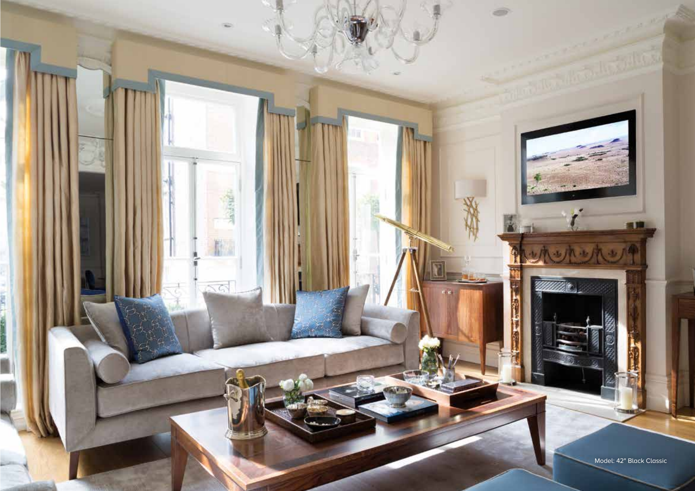
Model: 42" Black Classic