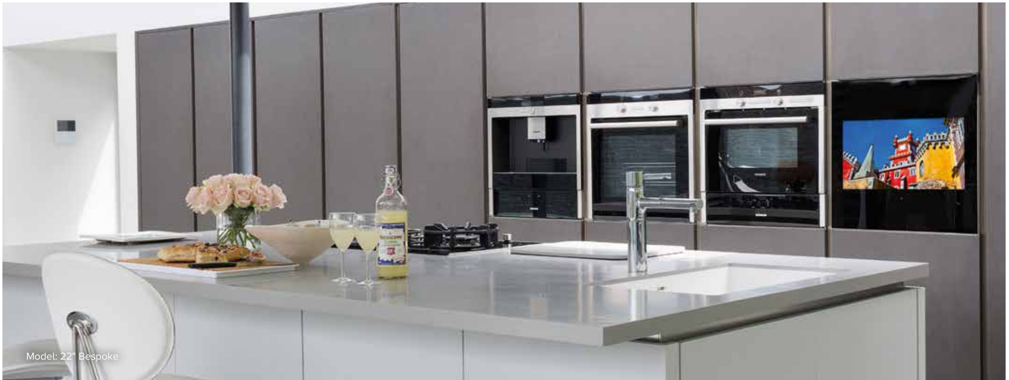
Model: 22" Bespoke

modern kitchen has been cleverly designed to combine luxury with functionality. An Aquavision should be an intrinsic part of the overall design, not an afterthought.