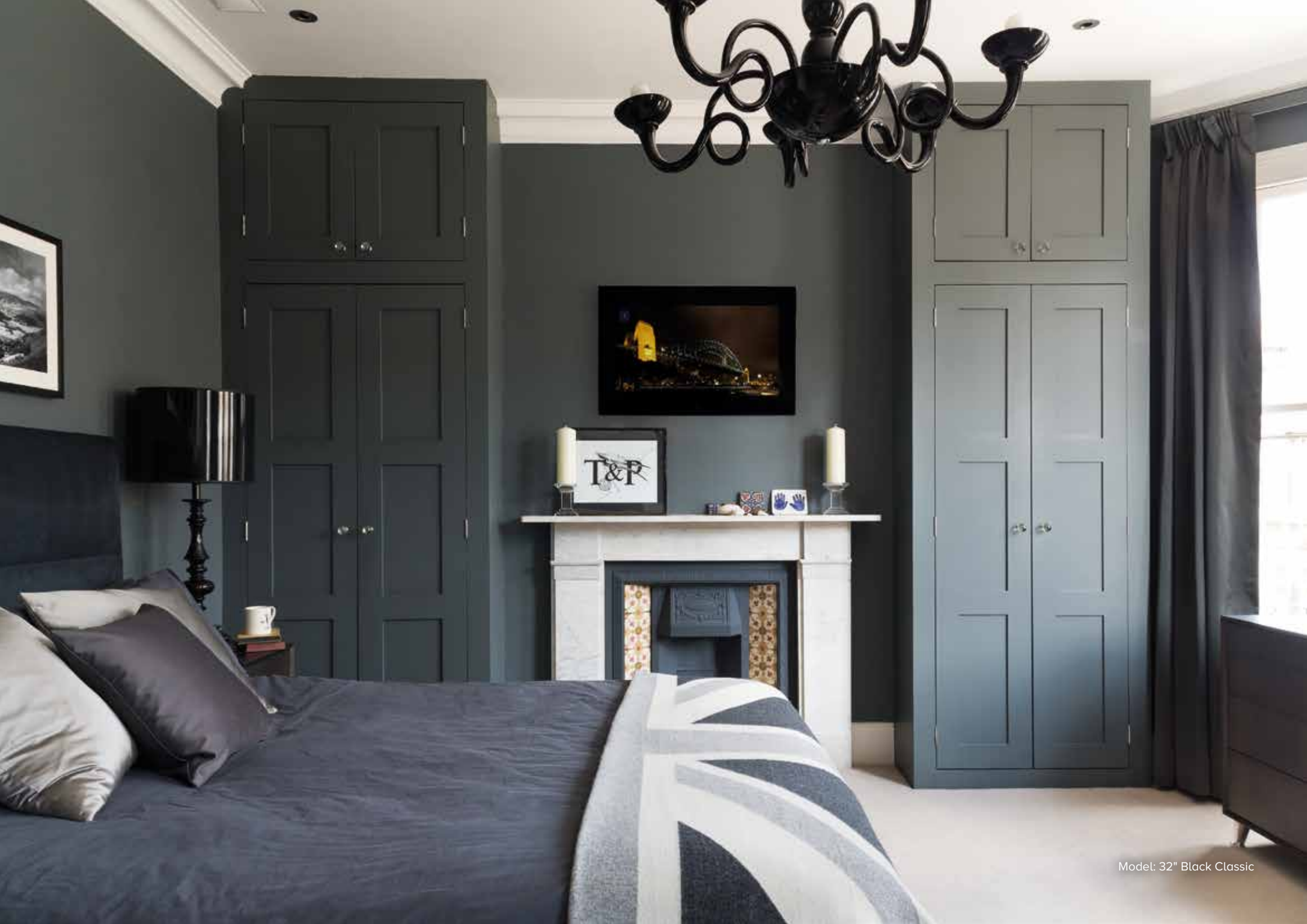
Model: 32" Black Classic