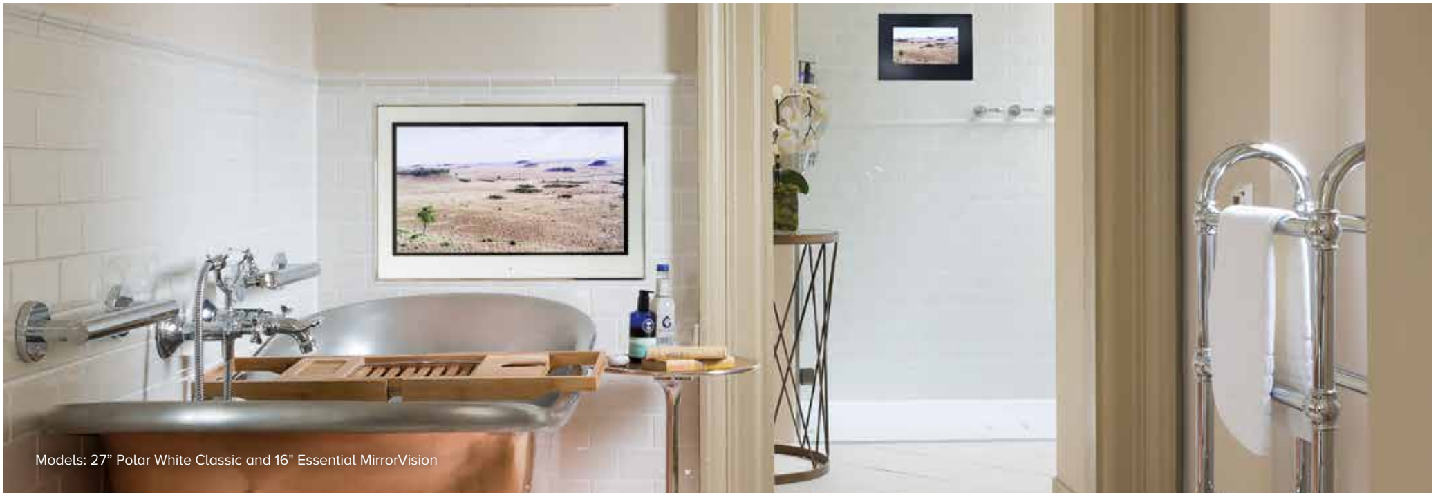
Models: 27" Polar White Classic and 16" Essential MirrorVision

on downloads, listening to favourite tracks or keeping up with current affairs, an Aquavision will transform your bathroom from a functional space to your own personal sanctuary.