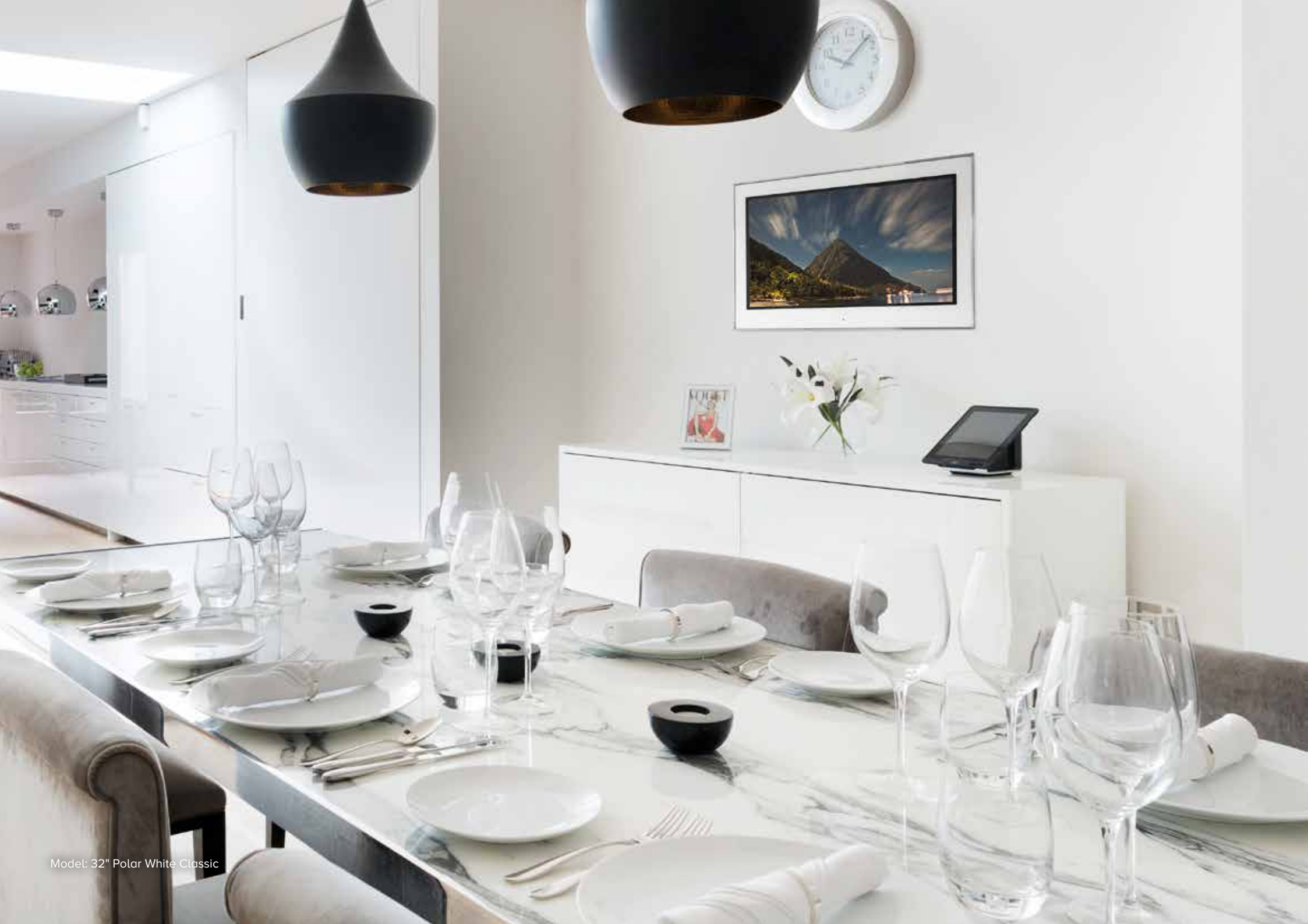
Model: 32" Polar White Classic