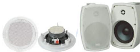
Pair of Water-resistant Wall or Ceiling Speakers