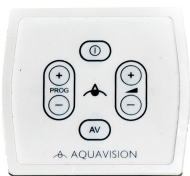
RSP4 Hard Wired Control Panel

Specifications shown were accurate at time of going to press. AQUAVISION'S® policy of continuous development means some changes may take place. Please check with the office for confirmation. All screen pictures simulated. All names and trademarks acknowledged. E. & O.E. REV 4.2.2